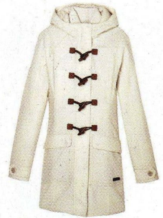
Merrell, $189; merrell.com