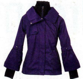
Columbia Sportswear, $230; columbia.com

Brands known for high-tech activewear debut new jackets that are too chic to confine to the slopes.