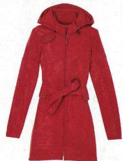
Lolë, $220; lolewomen.com